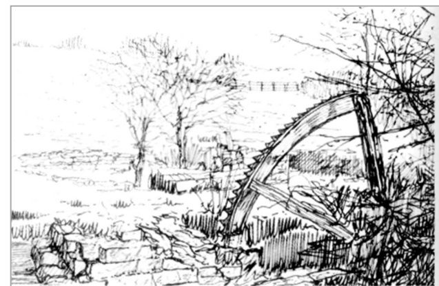
Ruins of Mill at King's Newnham

structure remained until the 1950s. A fire, however began the decline. A mill mentioned in the DB was probably on the same site. Walkers are urged not to enter the site as it is private property.